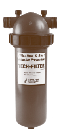
1 1/2" long