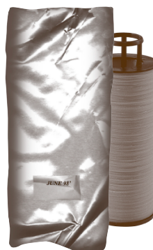
Sealed Techfilter cartridge