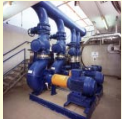
Drainage pump system