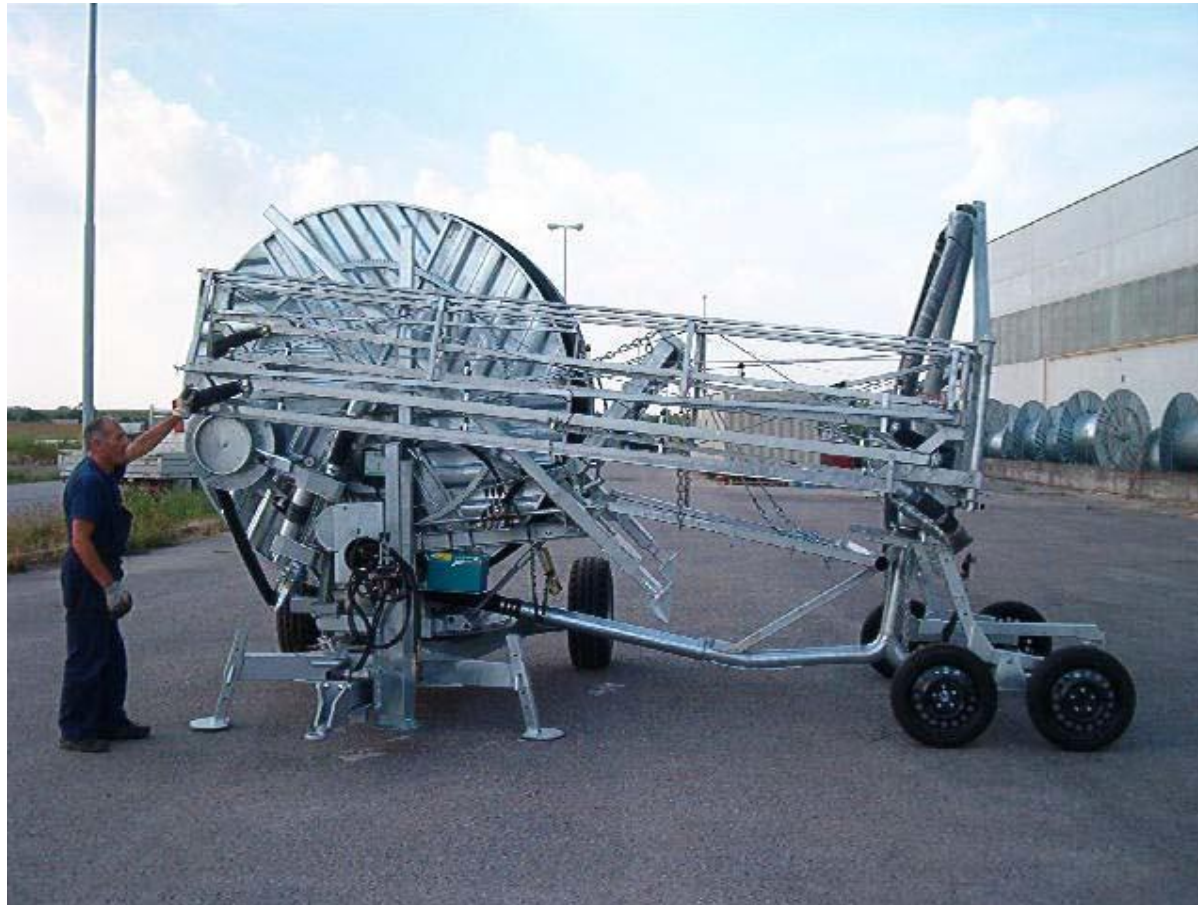
Left wing on its support