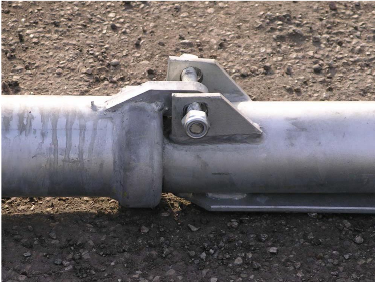
Quick and easy cart connection