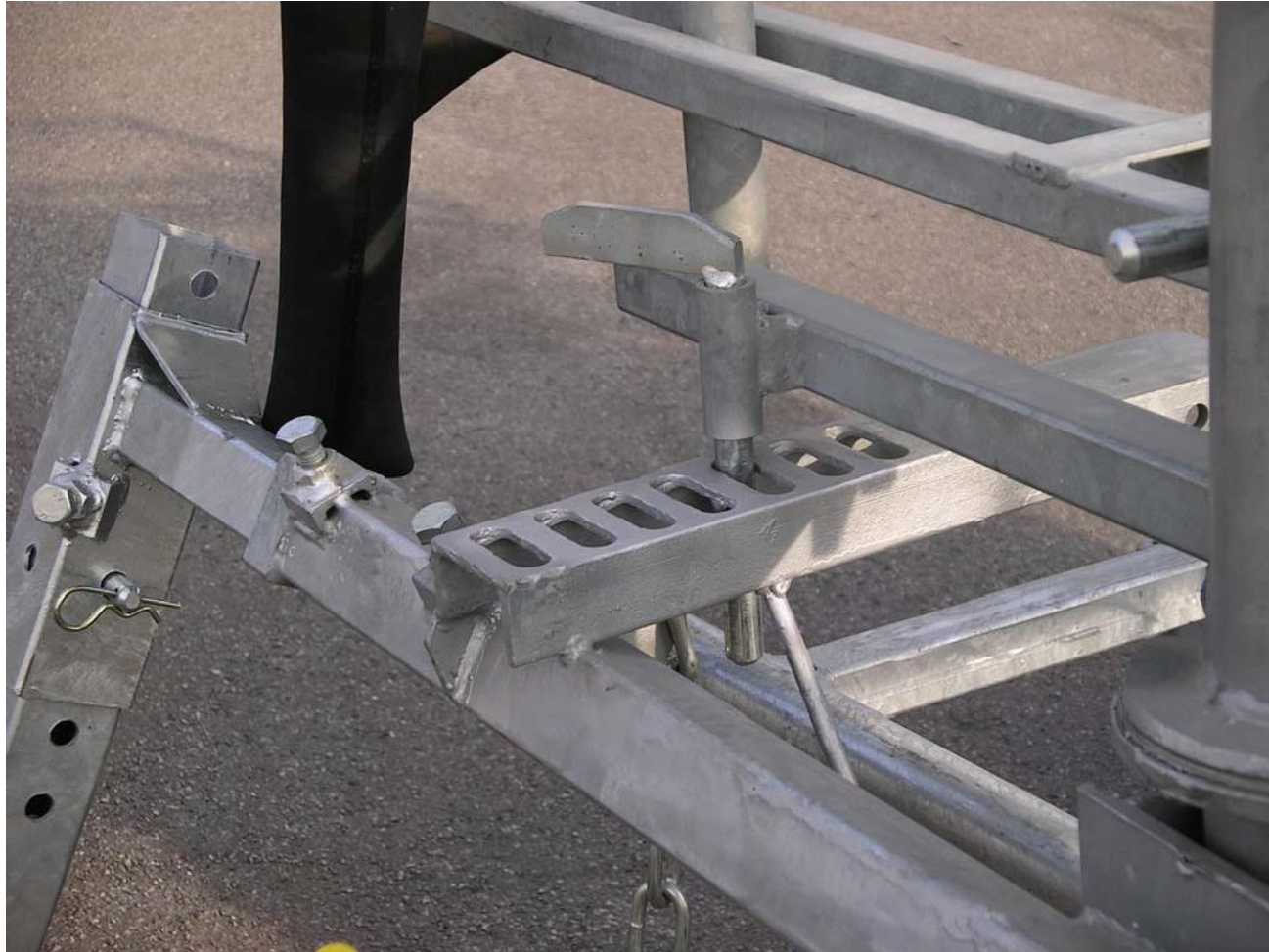
Adjustment holes and pin to stop rotation