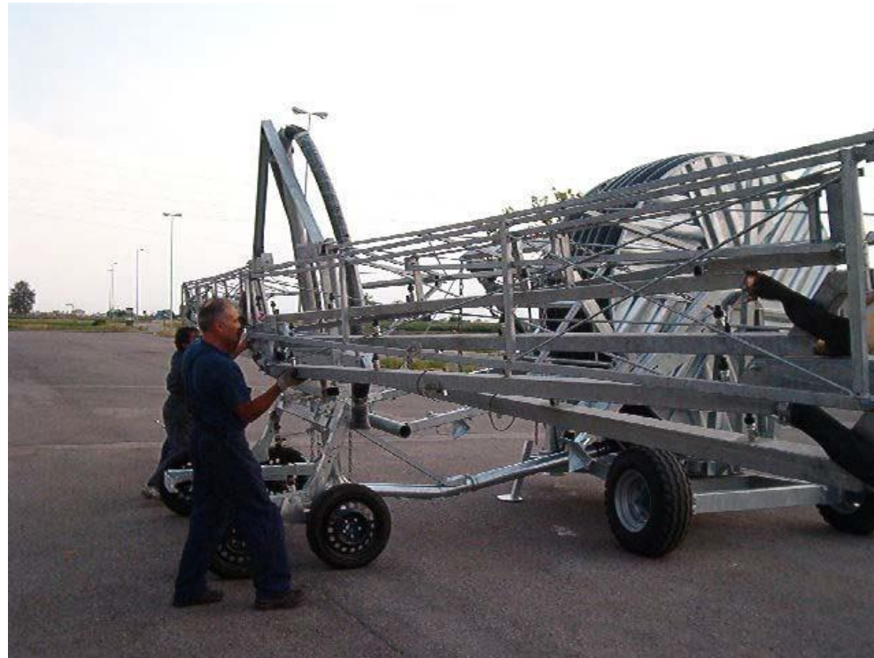
Folding the second section

Follow the same process to fold second section into the first.