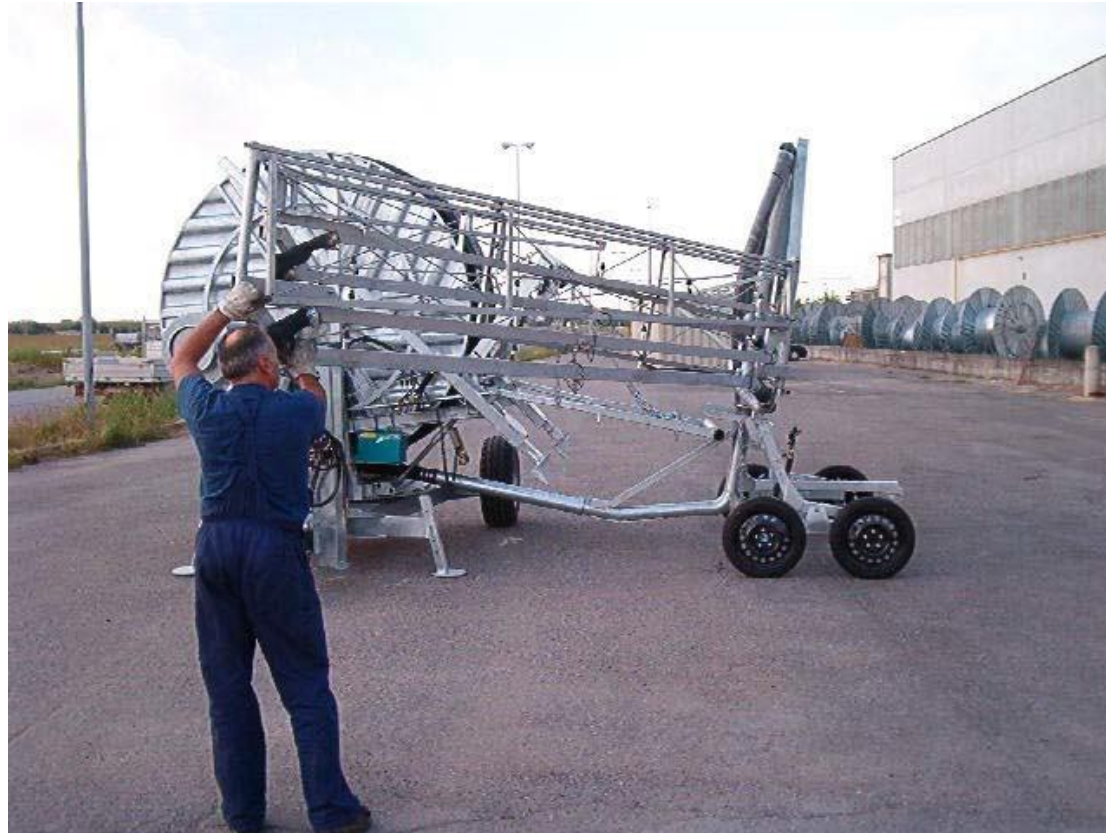
Folding the first section

Remove the middle bar, take the elastic pin off, go to the section end, lift it up and fold it