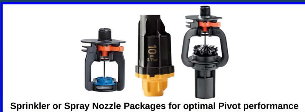
Sprinkler or Spray Nozzle Packages for optimal Pivot performance

Komet pivot sprinklers provide uniform water distribution across the entire cultivation area while maintaining a consistent droplet size. This way water loss due to wind and heat is minimized. The outstanding performance of our Komet Pivot Products is based on the interplay of sophisticated design and high-quality materials. Our Komet Precision Regulators provide an accurate and consistent outlet pressure with minimum pressure loss within the regulator. The unique and patented design promotes unimpeded water flow