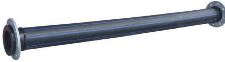
Suction Line - Straight - 6 Mtrs