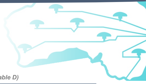
2.0mm Wall Thickness (Table D)