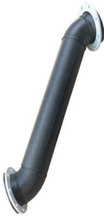
Goosenecks - Flanged