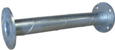
1.6mm Wall Thickness (Table D)