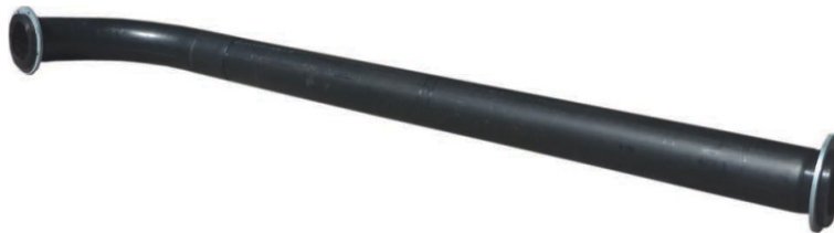
Suction Line complete with 45° Sweep Bend - 6 Mtrs